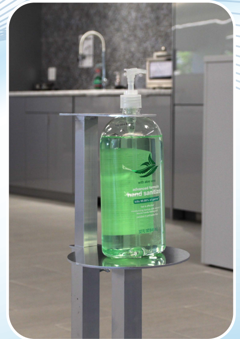
CAFETERIAS & LUNCH ROOMS