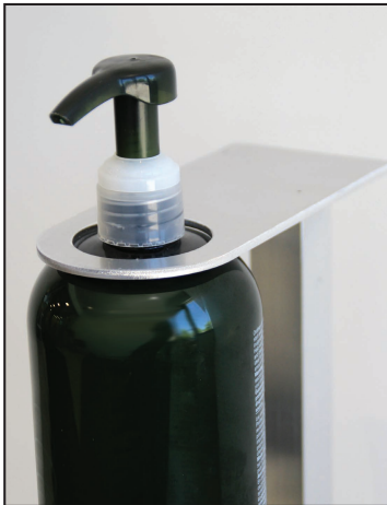
Top Bracket Accepts Most Pumps