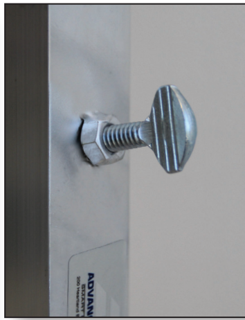
Thumb Screw Easily Secures Post In Place