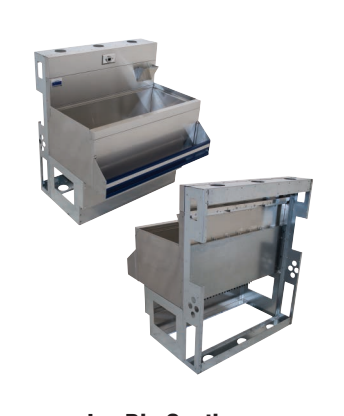
Ice Bin Section