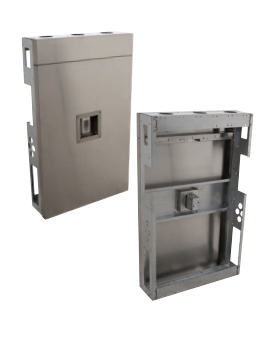
Flat Panel Section w/ Recessed Outlet